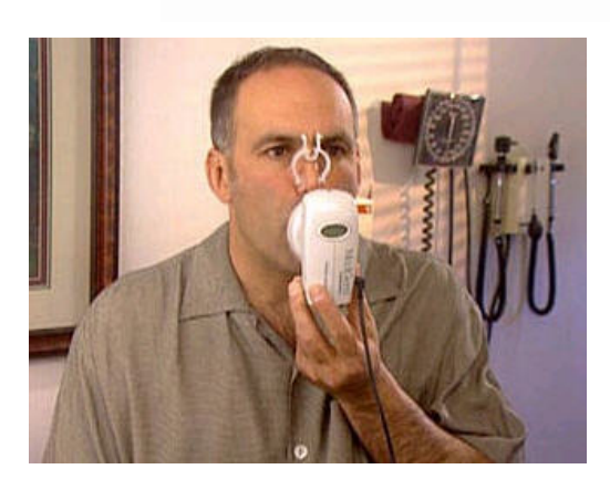
Figure 3. Individual RMR assessment using the MedGem<sup>®</sup> handheld indirect calorimeter.

Medical Necessity must be established in order for the MedGem to be considered for reimbursement.